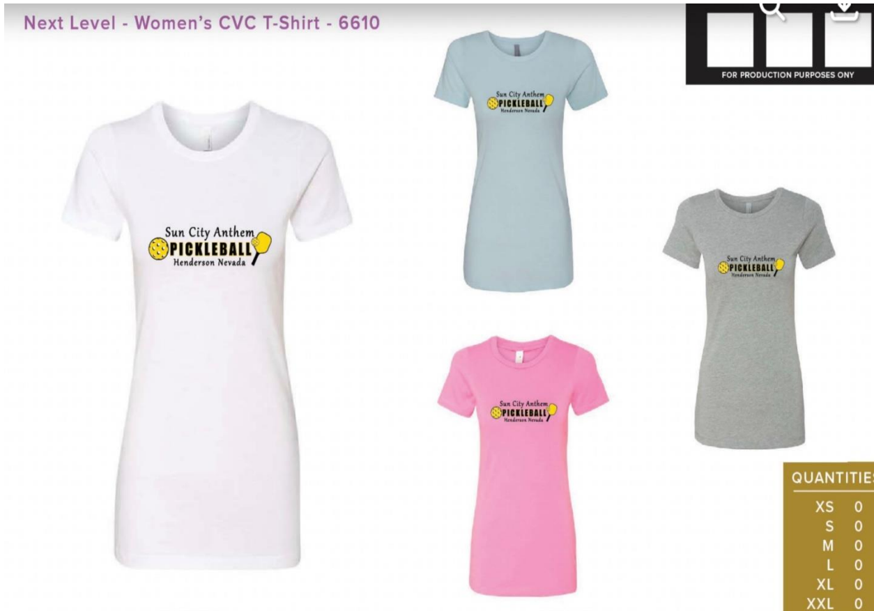
Figure 2- Ladies T- shirts

Figure 2 shows ladies' shirts which are tapered at the waist and have slightly shorter sleeves than the men's. Accordingly some of our ladies have already decided to order the men's or unisex type of shirt.