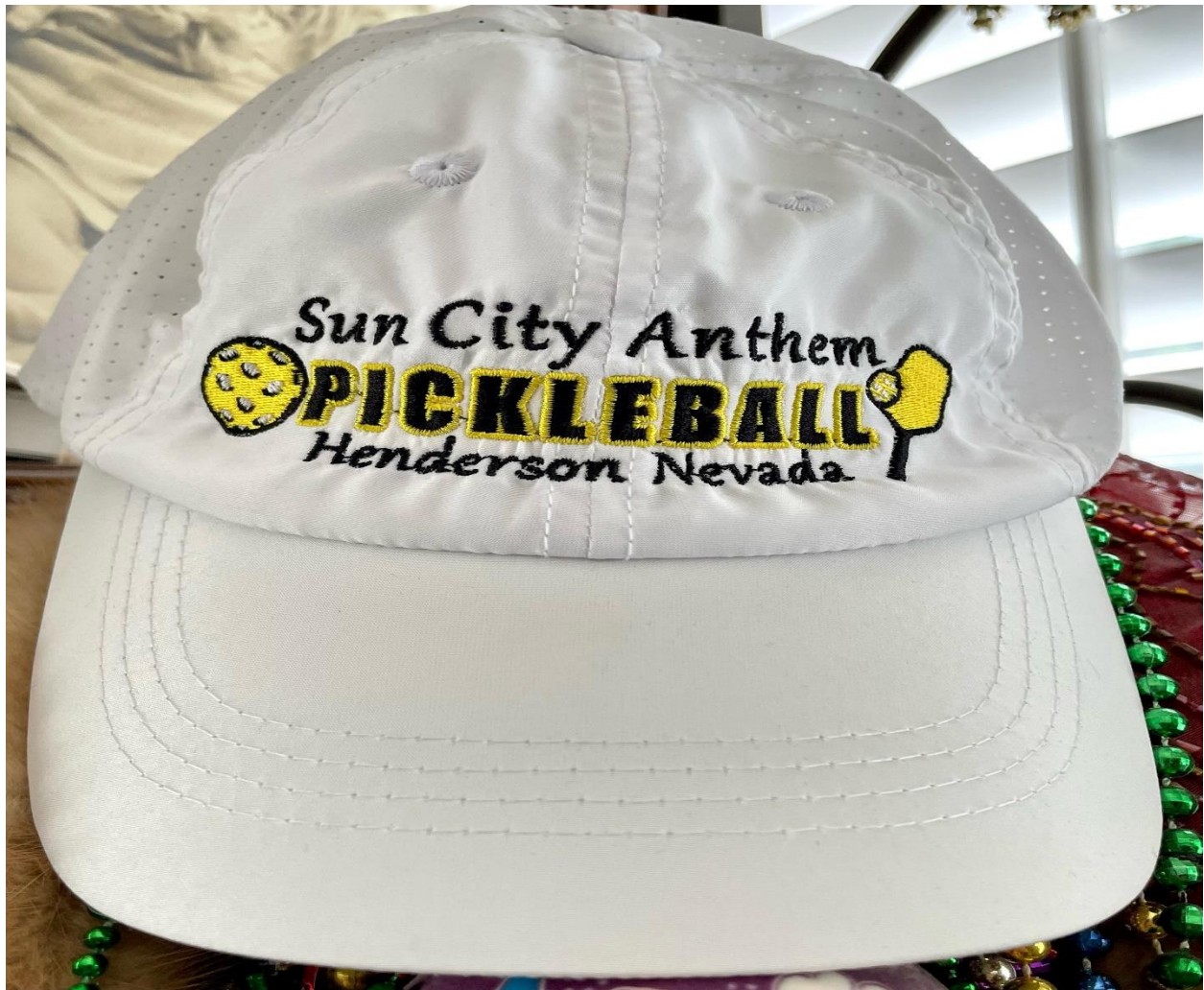
Figure 3 – Hats (unisex)

Any questions, please call Larry Strumwasser at 516-318-6366