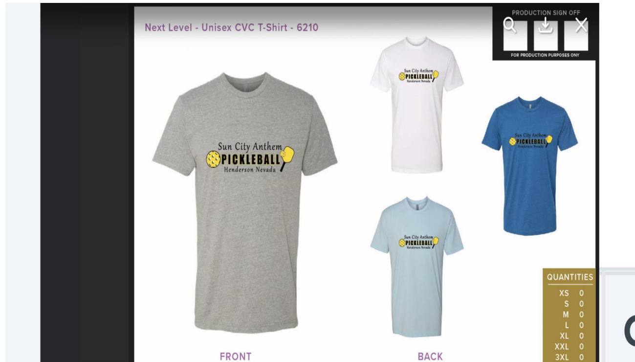
Figure 1- Mens unisex T-shirts

Make sure your T-shirt order form states your size preference, sex, and the color you wish.